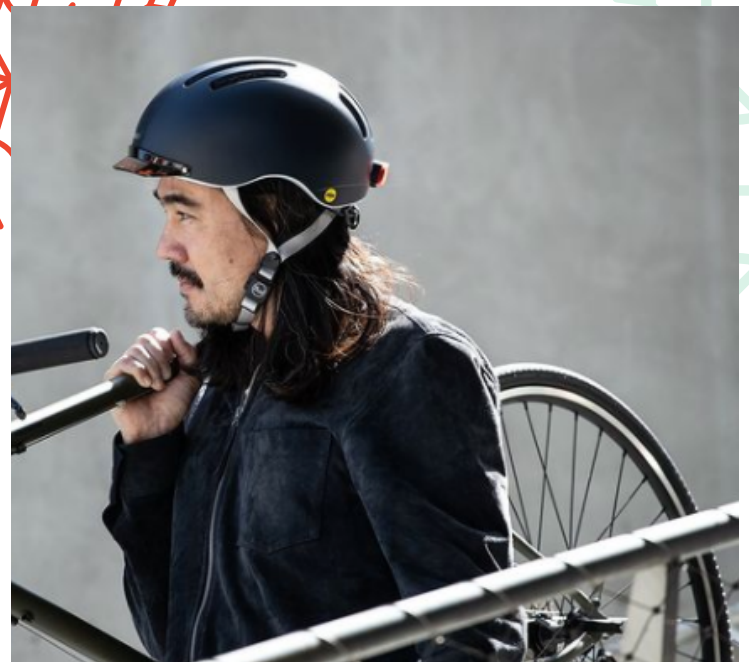
- THOUSAND - BEAUTIFULLY CRAFTED HELMETS WITH SAFETY IN MIND