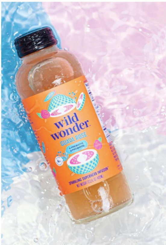
- WILDWONDER - THIRST QUENCHING DRINKS THAT COME IN A VARIETY OF FLAVORS