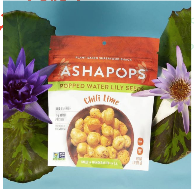
- ASHAPOPS - A DELICIOUS VEGAN + PALEO SNACK MADE OUT OF POPPED WATER LILY SEEDS